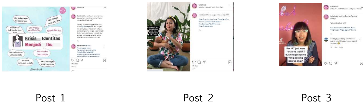
Figure 1: Post Halo Ibu Community