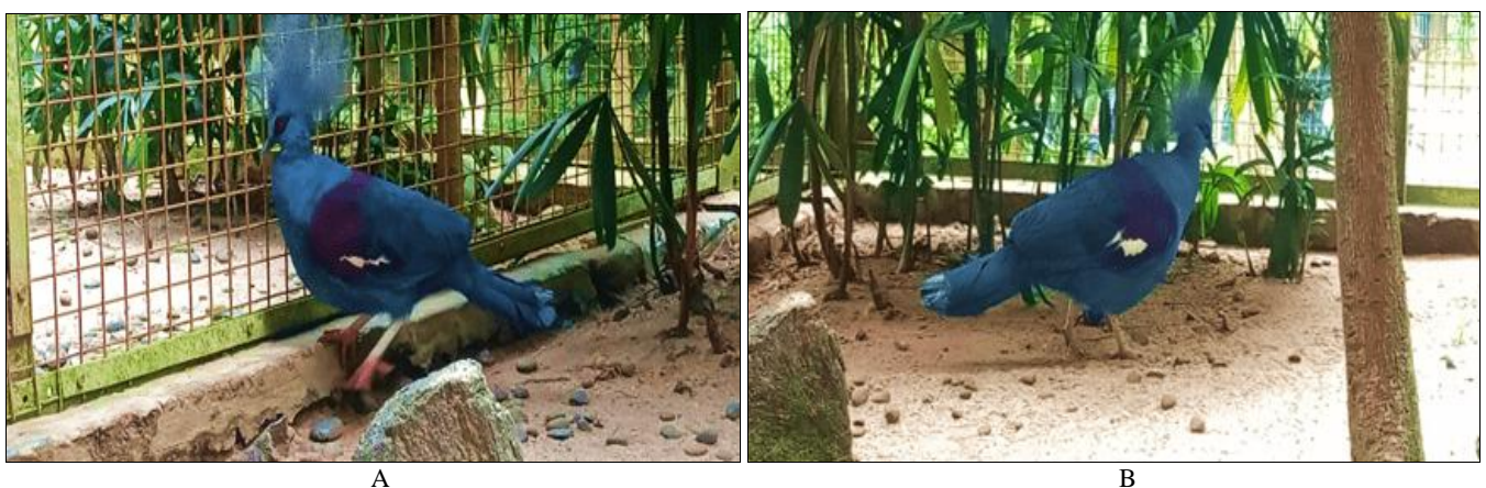
Fig 3: Goura cristata at Ragunan Zoo A. Male; B. Female

They are better equipped to evade predators and cover longer distances in search of females. Additionally, a smaller and lighter frame reduces energy expenditure during the mate-seeking process. In contrast, the female G. cristata possesses a longer body and a heavier body weight than the male (Figure 3B). This physical structure allows the female to store the nutritional reserves necessary for egg production and offspring care (Gold et al. , 2016) [6] .