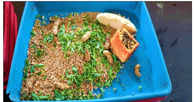
Fig 4: Goura cristata Feed at Ragunan Zoo

The diet for G. cristata at Ragunan Zoo consists of seeds, nuts, vegetables, and fruits (Figure 4). Seeds contain small amounts of protein and fat, which help strengthen stamina and accelerate feather growth and the overall health of G. cristata (Yamin et al. , 2023) [22]. Nuts provide high protein content, which is essential for growth and tissue repair in G. cristata (Xie et al. , 2016) [21]. Vegetables serve as a source of plant-based protein and are rich in vitamins and minerals, such as vitamins A, C, and iron, to aid digestion and enhance the resistance of G. cristata against diseases (Adawy & Abdel-Wareth, 2023) [1]. Fruits contain vitamin B6 to support energy metabolism and the nervous system of G. cristata , as well as to strengthen their immune system (Struthers, 2024) [18]. The seed category includes commercial feed (pellets/pur) and corn kernels. The vegetable category consists of bean sprouts and water spinach ( kangkung ), while the fruit category includes papaya and banana (Figure 4).