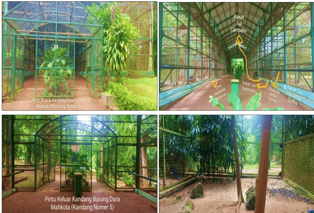
Fig 2: Goura cristata Enclosure at Ragunan Zoo A. Entrance to the New Poultry Section; B. Interior of the New Poultry Section; C. Exit of the New Poultry Section; D. Interior of the Goura cristata Enclosure