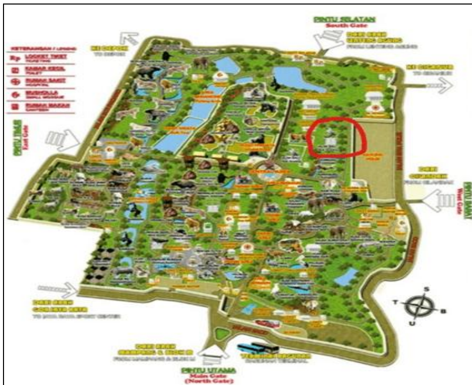
Fig 1: Site Map of Research Activities at Ragunan Zoo, Jakarta (Source: https://ragunanzoo.jakarta.go.id/visitors-info/map-direction/local_maps/ ). Accessed on March 30, 2025