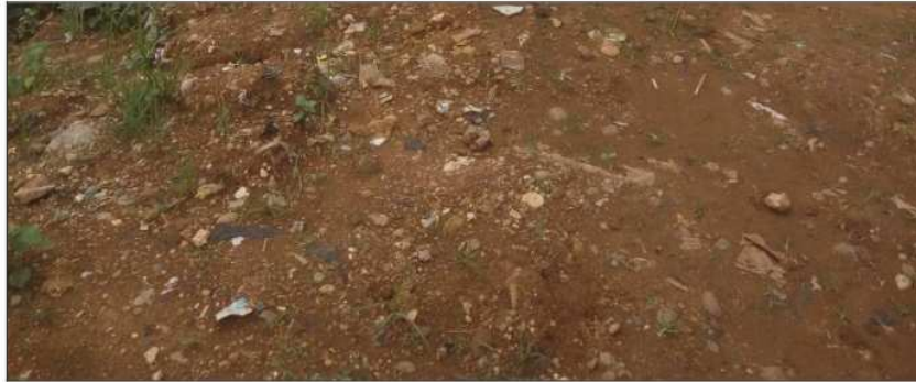
Fig 1: Environmental condition of sampling location

indicators of environmental pollution of heavy metals and carbon dioxide at locations adjacent to industrial and residential areas. The presence of bronze, iron, nickel, cadmium, sulfuric acid ions and other substances used in fertilizers were studied with pupae of different species from Geometridae and Noctuidae family. [24]