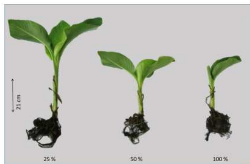
Figure 2. Four months old Canna indica grown under three light environments: A. Deep Shade (25% of natural light); B. Moderate Shade (50% of natural light); C. Full sun (100% of natural light).

( F=9.20 ; p<0.015 ), LAR ( F=39.12 ; p<0.001 ), and LWR ( F=5.81 ; p<0.039 ) in C. indica grown in low light (deep shade treatment) compared to those grown in full sun treatment (Figure 3). The highest values of LAR, SLA, and LWR were observed in low light (deep shade) grown C. indica , and the lowest was in full sun-grown plants (Figure 3).