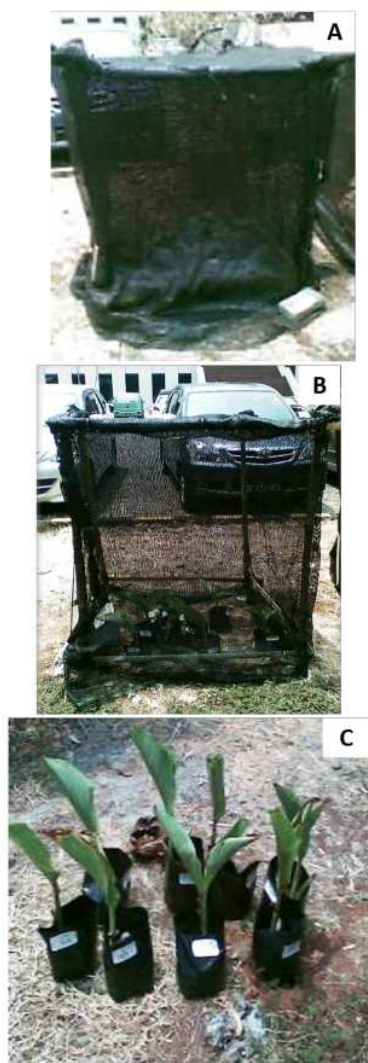
Figure 1. Canna indica grown under three light environments: A. Deep Shade (25% of natural light); B. Moderate Shade (50% of natural light); and C. Full sun (100% of natural light).

Before measuring, plants from each treatment were taken out from the polybags and carefully cleaned to remove the soil from the rhizomes. The plants were then separated into leaves, stems, and rhizomes, and dried to a constant weight at 70°C to obtain the dry weights. The leaf area was measured using millimeter block paper as described by Pan & Singh (2011). The SLA (Specific Leaf Area, the ratio of leaf area to leaf dry mass expressed in \text{cm}^2 \text{g}^{-1} ), LWR (Leaf Weight Ratio, the ratio of leaf weight to plant weight expressed in \text{g leaf g plant}^{-1} ), LAR (