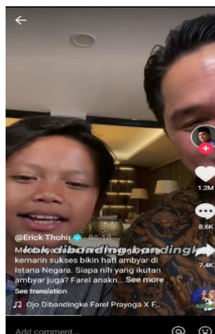
Picture 5: Erick Thohir and Farel 'Ojo Dibanding-Banding Ke'

In picture 4. You can see Erik Thohir surrounded by millennials doing choreography with the background music of a song or music that is a quite popular being performed simultaneously to show togetherness and as if depicting a part of young people who are compact and cheerful.