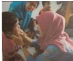
Figure 2. Dental examinations