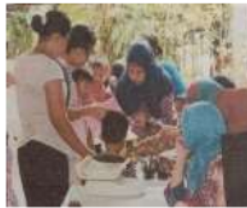
Figure 1. Monitoring children's growth