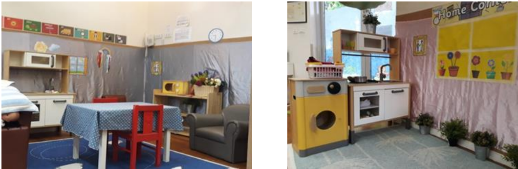
Figure 5. Drama Play Area

Next, there is a drama play area to stimulate all the child's senses and practice communication skills. For more details, you can see the image below.