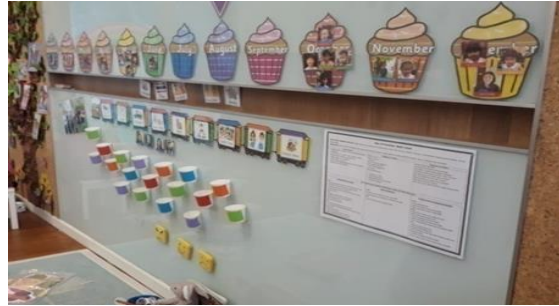
Figure 2. a Lot of a Little Bit Concepts in the Math and Science Area

Here, there is an outdoor area, children play using small rocks, soil, and leaves. the child observes fallen leaves, grass thrives on moist soil, grains of sand and so on. Seeing the outdoors will trigger all kinds of curious questions in children, leading to the learning and appreciation of life and its cycles and stimulation all the children's senses. For more details, you can see the image below.