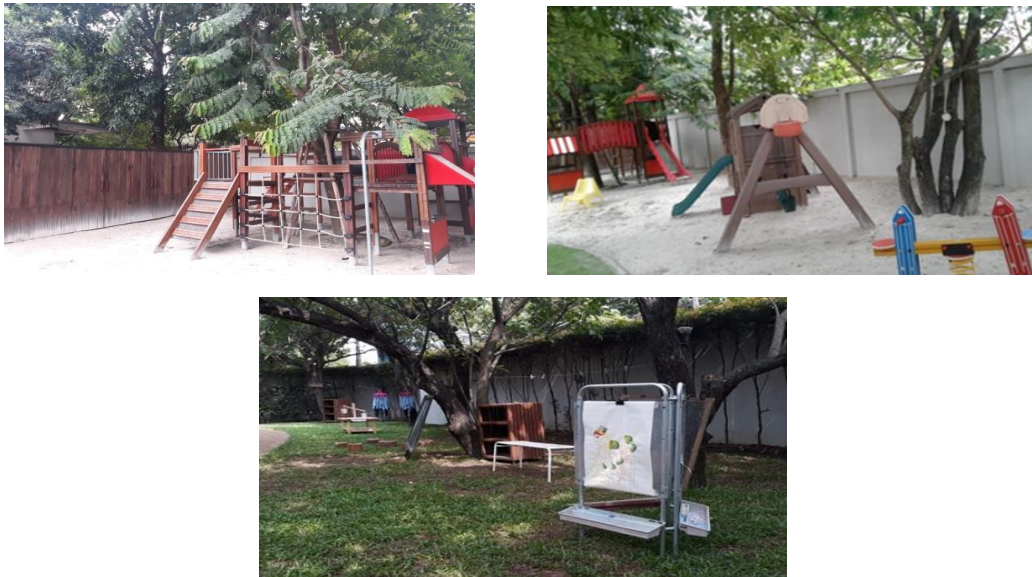
Figure 3. Play activities in the Outdoors

Here, there is an outdoor area, children play using small rocks, soil, and leaves. the child observes fallen leaves, grass thrives on moist soil, grains of sand and so on. Seeing the outdoors will trigger all kinds of curious questions in children, leading to the learning and appreciation of life and its cycles and stimulation all the children's senses. For more details, you can see the image below.