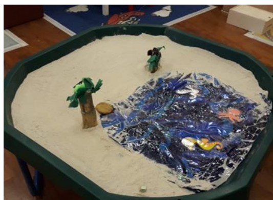
Figure 1. Painting Activities in Art Area

Classroom settings built on child-centered learning, In classrooms for art activities are found guitars, percussion instruments such as egg beaters, tambourine, bells, xylophones, and more. In connection with instruments the child learns about patterns and movements through sounds, trains fine motor skills, cooperates with friends, waits for his turn, and cultivates patience. A game project with musical instruments, the teacher invites the child to make noise using a stick, rubber band guitar, bottle shaker and nuts. Learning through instruments stimulates full sensory activity towards touch, visual, and hearing. In addition, the art activity classroom also provides art materials such as watercolors, clay, chalk, brushes, balls, cotton, sponges, grains and charcoal for children to experiment in the classroom. Through the power of inquiry the child learns about the world with art. Reggio Emilia's approach of using art in his learning is in harmony with the theory of communicating with the child. For more details on painting activities in the art classroom, you can see the picture below.