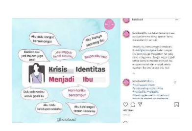
Figure 1: Post Halo Ibu Community

on their Instagram account @haloibuid. Informant SZ reflected that during the process of content making she feel reminded of the values she needs to hold to navigate her motherhood journey. She also feels esteemed knowing that she creates something worthy to her fellow mothers. Below are some of the examples of Halo Ibu community Instagram posts: