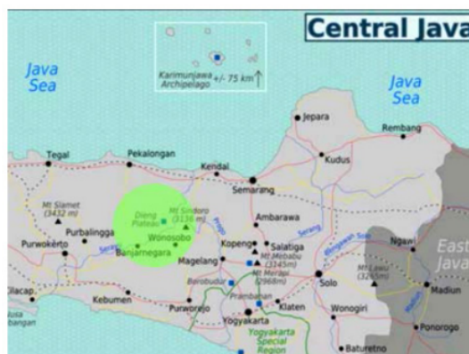
Figure 1 Location of Dieng Culture Festival (DCF)

DCF is pioneered by a tourism awareness group (POKDARWIS) of Dieng Kulon, Batur, Banjarnegara, Central Java. This cultural event is an activity to preserve the culture and tradition and to promote the potentials of natural and cultural tourism in Dieng, Central Java. Geographically, Dieng is located in the area of Wonosobo. The location is in Figure 1.