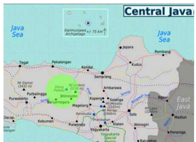
Figure 1 Location of Dieng Culture Festival (DCF)

DCF is pioneered by a tourism awareness group (POKDARWIS) of Dieng Kulon, Batur, Banjarnegara, Central Java. This cultural event is an activity to preserve the culture and tradition and to promote the potentials of natural and cultural tourism in Dieng, Central Java. Geographically, Dieng is located in the area of Wonosobo. The location is in Figure 1.