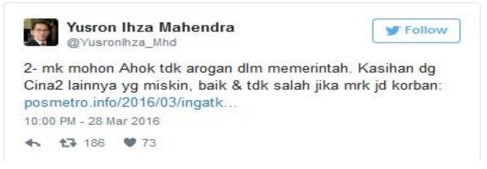
Picture 1.3 Post by Indonesia Ambassador for Jepang, Yusron Ihza Mahendra