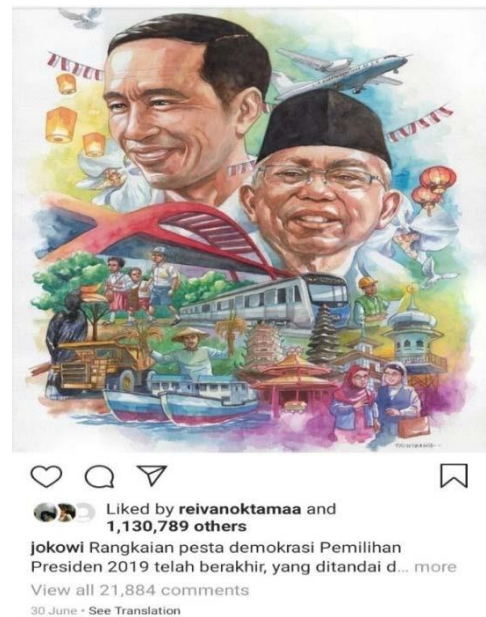
Figure 02. Posted on Jokowi’s Instagram Account as Incumbent

There are 21,884 comments on this posting on Candidate 01 account. The researchers here also took a number of samples to analyze the matter of comments in this public discussion room. From these comments, it can be seen that some people are supportive, while some others are contra and take actions against the post. In fact, some others people are neutral and actually not related to these posts.