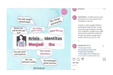
Figure 1: Post Halo Ibu Community

worthy to her fellow mothers. Below are some of the examples of Halo Ibu community Instagram posts: