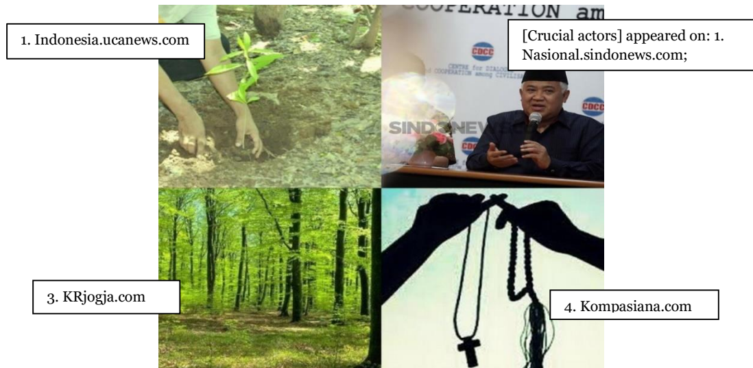
Figure 2. Visual images in a few news with the keyword “Berita Agama dan Lingkungan”