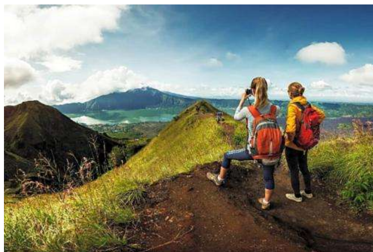
Figure 8 Some tourists enjoyed the beauty of Mount Batur at Kintamani, Bali