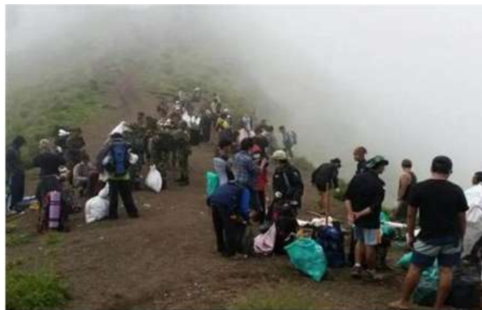
Figure 4 Some Mountain Climbers Brought Big Plastic Bag for Collecting Garbage

In the second paragraph, kompas.com indicates Trashbag Community already had a record of environmental problems on mountains area in Indonesia. Trashbag Community is a community for nature lovers who very care about the cleanliness of the environment in the mountains, forests, beaches, and the sea as tourist attractions in Indonesia. The community has a slogan: Keep Our Mountain Green and Clean.