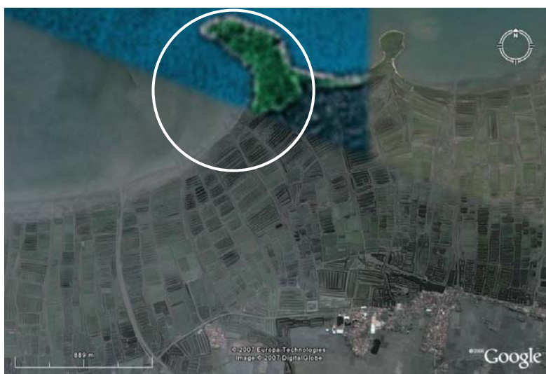
Figure 1. Pulau Dua Nature Reserves, Serang, Banten Province (Source: Google Map)

This research consisted of field research and laboratory research. The field research was conducted in CAPD, Serang (Figure 1).